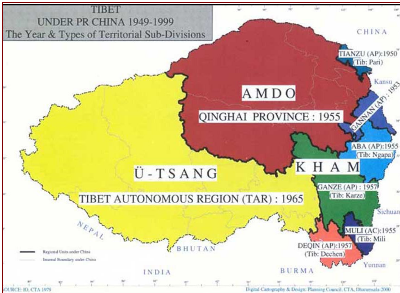
Map of Tibet under PR China, showing year and types of Territorial Sub-Divisions

Tibetan Language Institute P.O. Box 2037 Hamilton, MT 59840 USA Tel: 406/ 961-5131 Email: info@tibetanlanguage.org www.tibetanlanguage.org