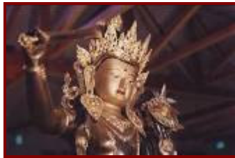
Manjushri (Tibetan: Jampel Yang)

Shakyamuni Buddha said, "In the Degenerate Age I will live in the sacred letters."